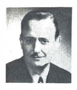
JOHN DICKSON CARR, famous mystery writer. What I look for is not a clumsy concoction of boy-meets-girlwith detective incidents. but a detective story with an original idea. That's what I find in every issue of ELLERY QUEEN'S MYSTERY MAGA. ZINE. That's why I think EQMM is the best detective magazine in the busi-