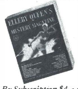
By Subscription $4 a year